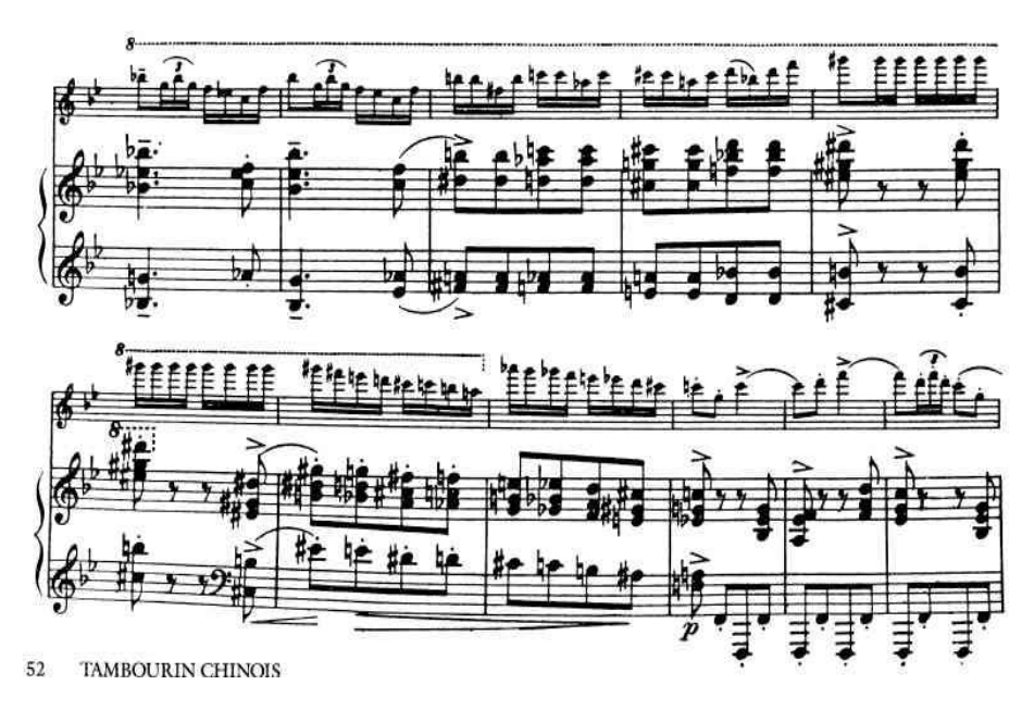
Fig. 13 Fritz Kreisler, Tambourin Chinoise op. 3, mm. 39-49

entire phrase (in A Major) is sequenced strictly, then freely at ascending thirds (C Major and E flat Major) in order to reach a climax (mm. 43), harmonised with a ninth Major chord on C # Major, found at a distance of eight dominants (fig. 13).