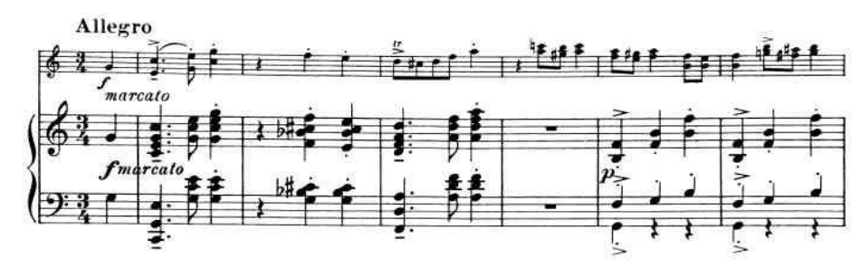
Fig. 1 Fritz Kreisler, Liebesfreud, op. 10 no. 1, mm. 1-6

Period A debuts with an anacrusis, lending the miniature dance-specific momentum, which leans precisely on the general crotchet rest on the first beat in the third measure, perceived as an impulse for the unstressed beats. This effect is so strong that it creates a veritable springboard for the following melodic outline. Although the waltz debuts with an upbeat of one beat only (a crotchet), we immediately ascertain that the consistent anacruses are actually formed of two beats. The rhythmic type is maintained at the beginning of the second phrase, also (mm. 4-8), but Kreisler galvanises the outline through a hemiolic series, transforming the ternary pulsation into binary groups. We remark that while the violin plays a new formula in thirds, the piano continues to accompany in a ternary manner, in ascending arpeggios, a version obviously derived from the first motif. The consistent period resumes the two phrases