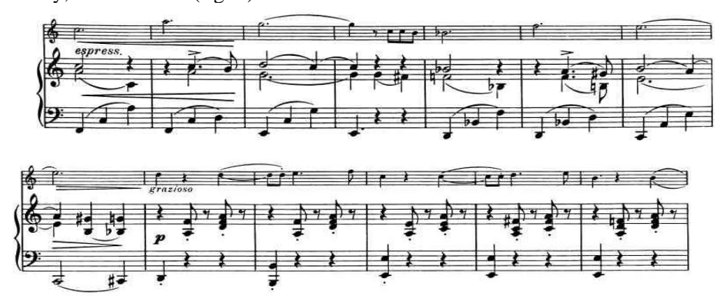
Fig. 5 Fritz Kreisler, Liebesleid op. 11 nr. 2, mm. 33-45

The miniature continues with a new structure, which takes us to the area of the subdominant, F Major - D Minor, in order to cadence again to the base tonality, i.e. to Minor (fig. 5).