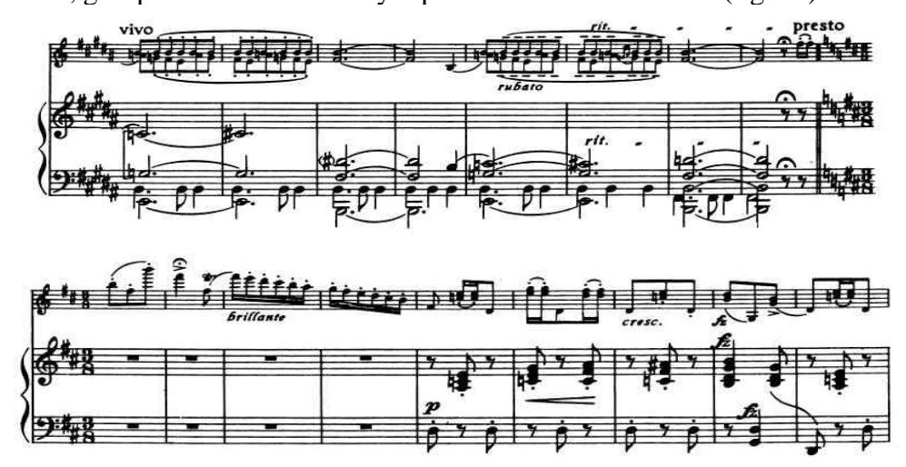
Fig. 11 Fritz Kreisler, Caprice Viennois op. 2, mm. 60-76

The theme is displayed in thirds and fourths at the violin, which renders certain glissandos necessary, a fact which discreetly "vocalises" the melody. Both the rhythmic-harmonic sonic profile and the architecture are tributary to the nostalgic and sentimental Viennese traditional melodies. The double period is made up of simple, symmetrical, related phrases. The accompaniment of the violin is extremely simple in order to draw one's attention to the undulating itinerary of the violin, limiting itself, however, to discreetly supporting the characteristic rhythm, dotted crotchet, quaver, crotchet. As in the previously analysed miniatures, step by step, the piano joins the discourse with chromatic counter-melodies, supporting the discourse of the violin. As the melody unfurls, the discourse is amplified and enriched through ornaments and increasingly larger leaps, underlined through ritenuto, an indication allowing the violinist to action the exchanges in high positions. Finally, structure A closes with a conclusive period, più vivo, evocatively proposed by the violin through a pedal of tonic B, while the inferior voice outlines a descending profile, grouped on an obsessively repeated hemiolic structure (fig. 11).