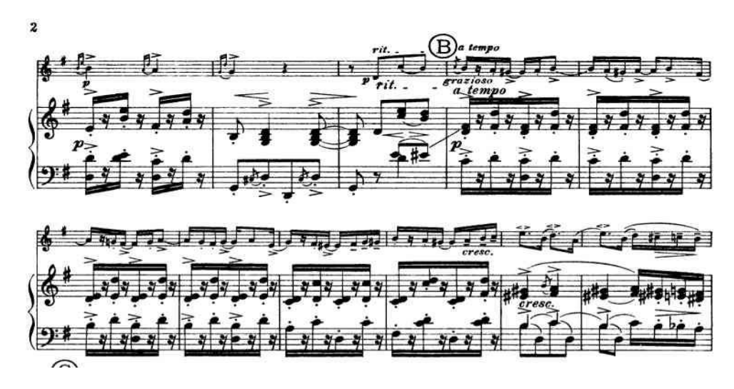
Fig. 17 Fritz Kreisler, Syncopation, mm. 18-28

From an architectonic point of view, the second exposition of section A is built by sequencing a diatonic formula, polyrhythmically repeated and syncopated, sometimes completed through chromatic itineraries. This irregular sixteenth-note pulsation only stops at phrase end, where the cadence is clearly undelined by both partners through harmonic crotchet itineraries. Yet, in this segment, Kreisler prefers another way of underlining the cadence, one characteristic to the ragtime genre, chromatised and syncopated on the violin level and at the pianist's right hand, while the low register of the piano clearly displays the pulse of quavers created through sixteenth notes followed by rests (fig. 18).