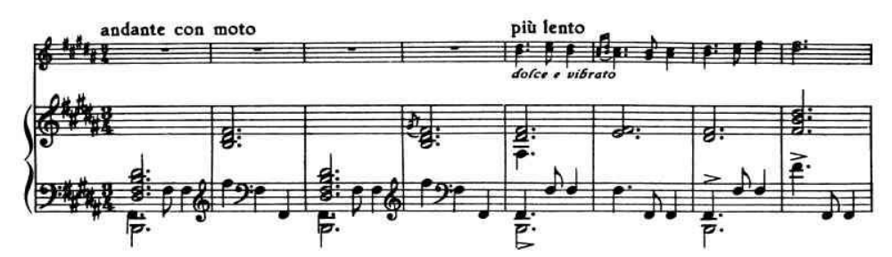
Fig. 10 Fritz Kreisler, Caprice Viennois op. 2, mm. 16-23

The theme is displayed in thirds and fourths at the violin, which renders certain glissandos necessary, a fact which discreetly "vocalises" the melody. Both the rhythmic-harmonic sonic profile and the architecture are tributary to the nostalgic and sentimental Viennese traditional melodies. The double period is made up of simple, symmetrical, related phrases. The accompaniment of the violin is extremely simple in order to draw one's attention to the undulating itinerary of the violin, limiting itself, however, to discreetly supporting the characteristic rhythm, dotted crotchet, quaver, crotchet. As in the previously analysed miniatures, step by step, the piano joins the discourse with chromatic counter-melodies, supporting the discourse of the violin. As the melody unfurls, the discourse is amplified and enriched through ornaments and increasingly larger leaps, underlined through ritenuto, an indication allowing the violinist to action the exchanges in high positions. Finally, structure A closes with a conclusive period, più vivo, evocatively proposed by the violin through a pedal of tonic B, while the inferior voice outlines a descending profile, grouped on an obsessively repeated hemiolic structure (fig. 11).