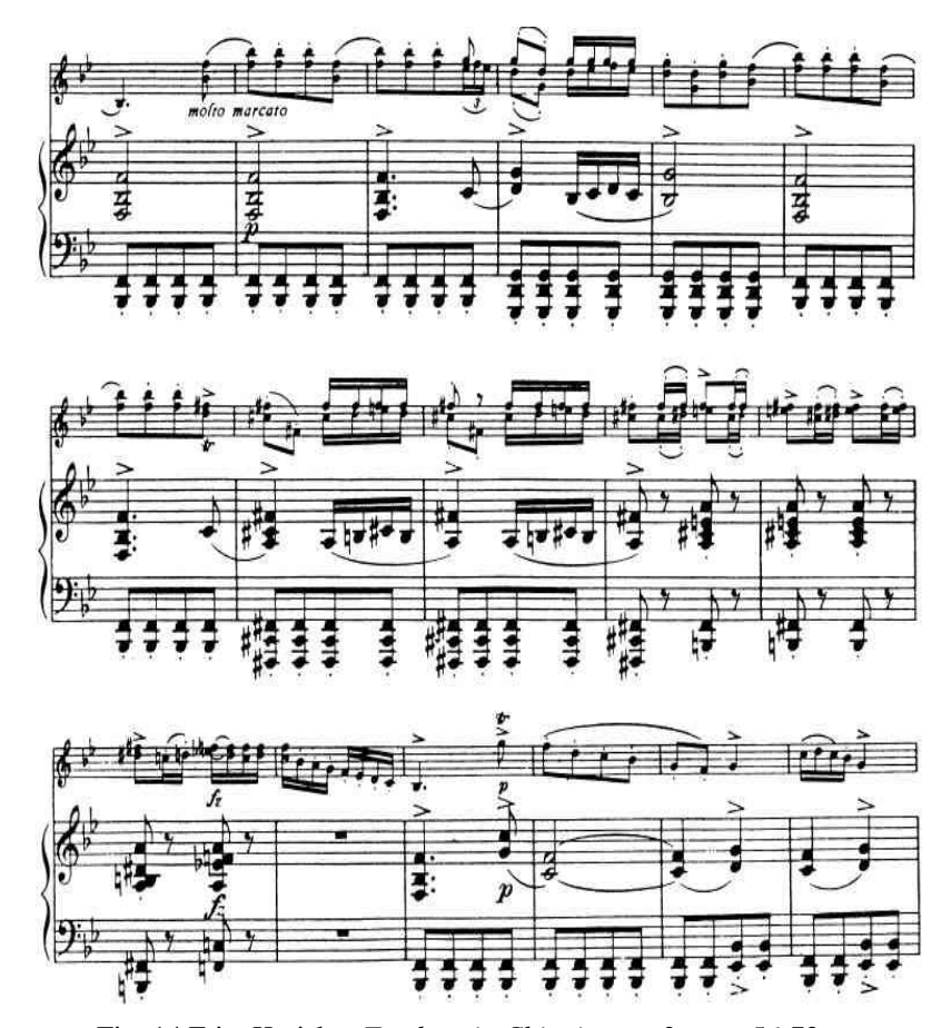
Fig. 14 Fritz Kreisler, Tambourin Chinoise op. 3, mm. 56-72

The contrast on a tonal level but also in writing is brought by the second se, ction, Più lento (B), in which the tempo becomes twice as slow (the crotchet becomes a minim) and the type of writing is drastically modified. The isocronous pulsation of staccato piano quavers is abandoned in favour of a free singsong, accompanied through arpeggios. From a tonal point of view, the structure debuts uncertainly, oscillating in the area of G Major . We remark that here, also, the composer uses a more evolved harmonic language, avoiding a clear tonal display in favour of a more diffuse one with added sounds, whose sonority makes us think of jazz. However, the architecture of the phrases is a "European", proportioned one, even if the rhythmics of the violin seems to avoid the firm display of the strong beats, in a free progress, grafted onto the piano accompaniment, with a syncopated rhythm emphasised through accents, a moment, which, again, can make us think of rhythmic patterns of jazz (fig. 15).