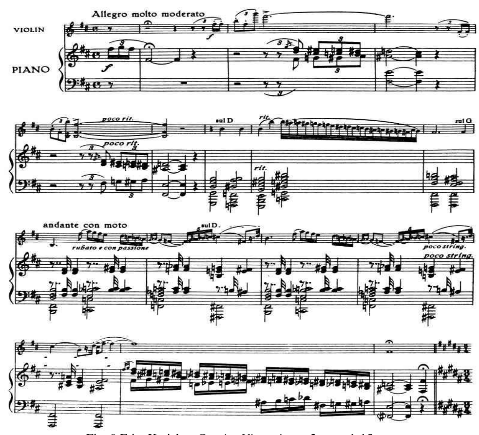
Fig. 9 Fritz Kreisler, Caprice Viennois op. 2, mm. 1-15

A phrase with a new melodic profile ( Andante con moto ) is evocatively proposed by the violin. This time the leaps are alternated with a gradual, sometimes chromatic itinerary, while the harmonic itinerary of the piano is galvanised through very short and threatening thirty-second-note anticipations. Although the atmosphere seems changed, we, however, recognised the obsessively repeated "signal" element from the debut of the Introduction. The entire section closes with a long F# (the dominant) of the violin, under which we hear the descending chromatic itinerary of the piano, much amplied and galvanised by sixteenth notes.