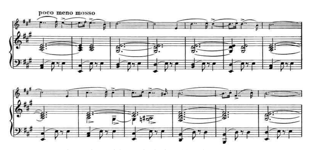
Fig. 6 Fritz Kreisler, Liebesleid op. 11 nr. 2, mm. 65 – 77

Without repeating the first structure A, Kreisler modulates to the A Major homonym. The tempo is slower, the discourse changes, it seems a remembrance of nostalgic memories. The melodic profile is wavy, gradually predominant, galvanised through hemiolas, overlapping the binary of the violin and the ternary accompaniment of the piano (fig. 6).