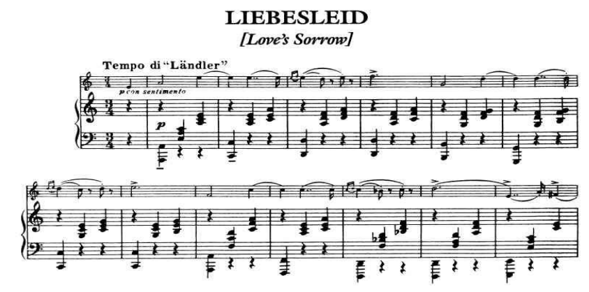
Fig. 4 Fritz Kreisler, Liebesleid op. 11 nr. 2, mm. 1-13

The second motif is undulating, graduate, with the cadence on the subdominant. We have to remark the rhythmic type of the cadence, with short sounds (quavers followed by rests), which stress the nostalgic, evocative character of the melody. The following phrases sequence the pattern freely and have modified cadences, being galvanised through hemiolas. The second exposition (a double period) repeats the first section, with the piano discreetly acting in counterpoint.