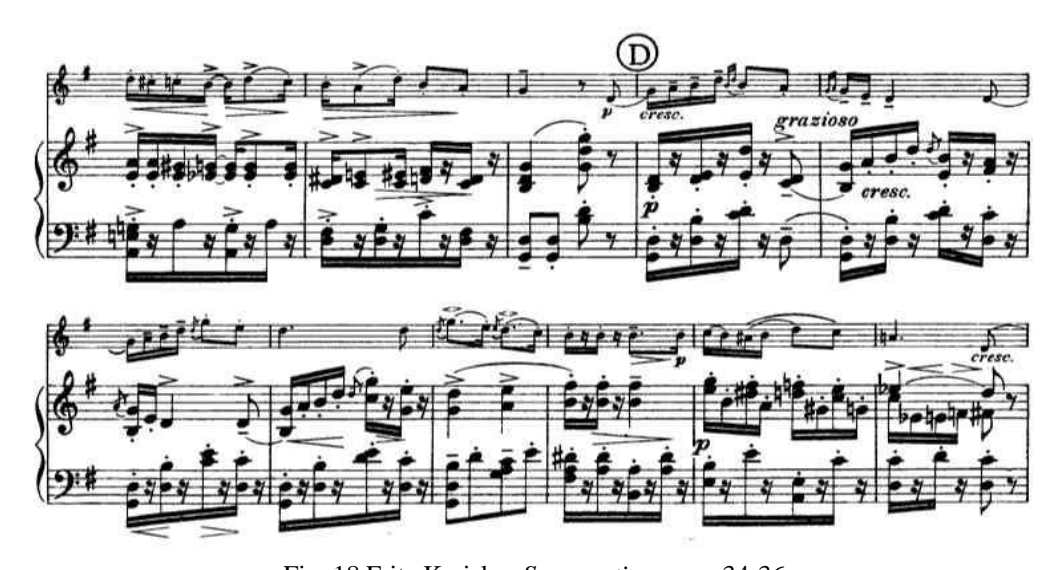
Fig. 18 Fritz Kreisler, Syncopation, mm. 34-36

From an architectonic point of view, the second exposition of section A is built by sequencing a diatonic formula, polyrhythmically repeated and syncopated, sometimes completed through chromatic itineraries. This irregular sixteenth-note pulsation only stops at phrase end, where the cadence is clearly undelined by both partners through harmonic crotchet itineraries. Yet, in this segment, Kreisler prefers another way of underlining the cadence, one characteristic to the ragtime genre, chromatised and syncopated on the violin level and at the pianist's right hand, while the low register of the piano clearly displays the pulse of quavers created through sixteenth notes followed by rests (fig. 18).