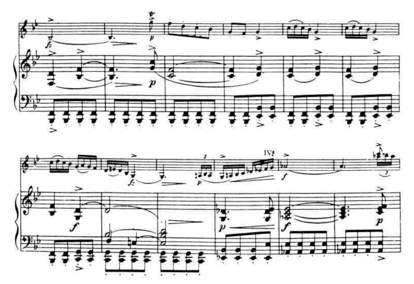
Fig. 12 Fritz Kreisler, Tambourin Chinoise op. 3, mm. 1-22

Another interesting element is also the inner construction of the phrases, evidently contradicting the "European type", the Viennese, simple, symmetrical, well-proportioned type. Thus, the first motif (mm. 2-4) debuts with an upbeat of a quaver ornamented with a trill , followed by a descending staccato series of other quavers, which stop onto a stressed crotchet on the second beat of the measure. This formula is condensed, varied through an ornamentation of sixteenth notes and becomes a model for an identical (mm. 5-6) or transformed repetition, developed through elimination (mm. 7-9), since it losses the stress on the weak beat, a technique reminiscent of stretto . After this precipitation with a developing role, the third motif closes with a long stressed sound. It is presently followed by the conclusive motif 4 (mm. 9-12), made up of small written ornaments, closed through a long B flat , representing the tonic.